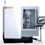
VOLLMER VGRIND 160

Whoever wants to shape the future will need forward-looking rotary tools – and intelligent solutions for their production, processing and maintenance. VOLLMER supports you: with innovative sharpening and eroding machines to suit virtually every requirement. With economical automation options and strong services. For the highest possible flexibility, efficiency and quality of results. The future takes shape: with precision from VOLLMER.