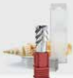
Center Pack Collet