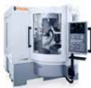
VOLLMER QXD 250