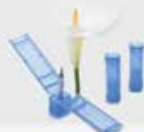
Split Micro Pack