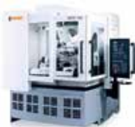
VOLLMER QWD 760H