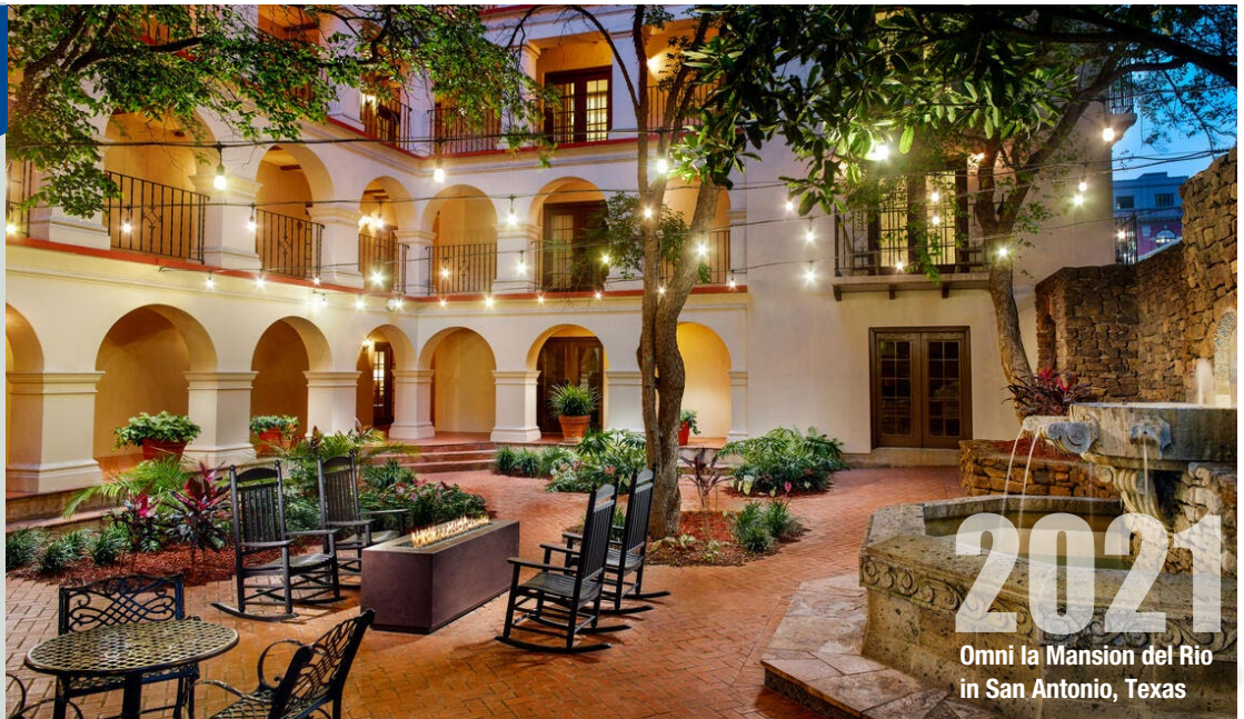
2021 Omni la Mansion del Rio in San Antonio, Texas