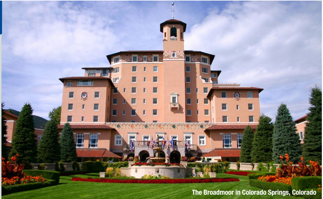
The Broadmoor in Colorado Springs, Colorado

May 15-17, 2021 The Greenbrier White Sulphur Springs, West Virginia